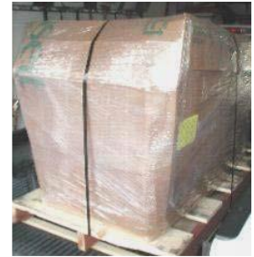
Example of wheat stamp / 2-part ISPM / HT Marking