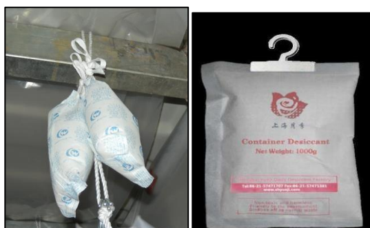
Chart 2.1 - Reference dosage (Calcium Chloride):